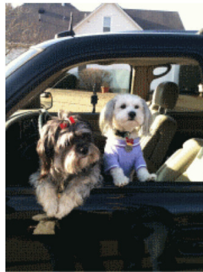
Mojo and Maggie