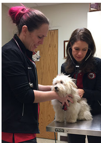
Meeting the cardiologist