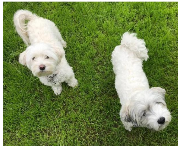
Diamond and Dozer running through the grass.